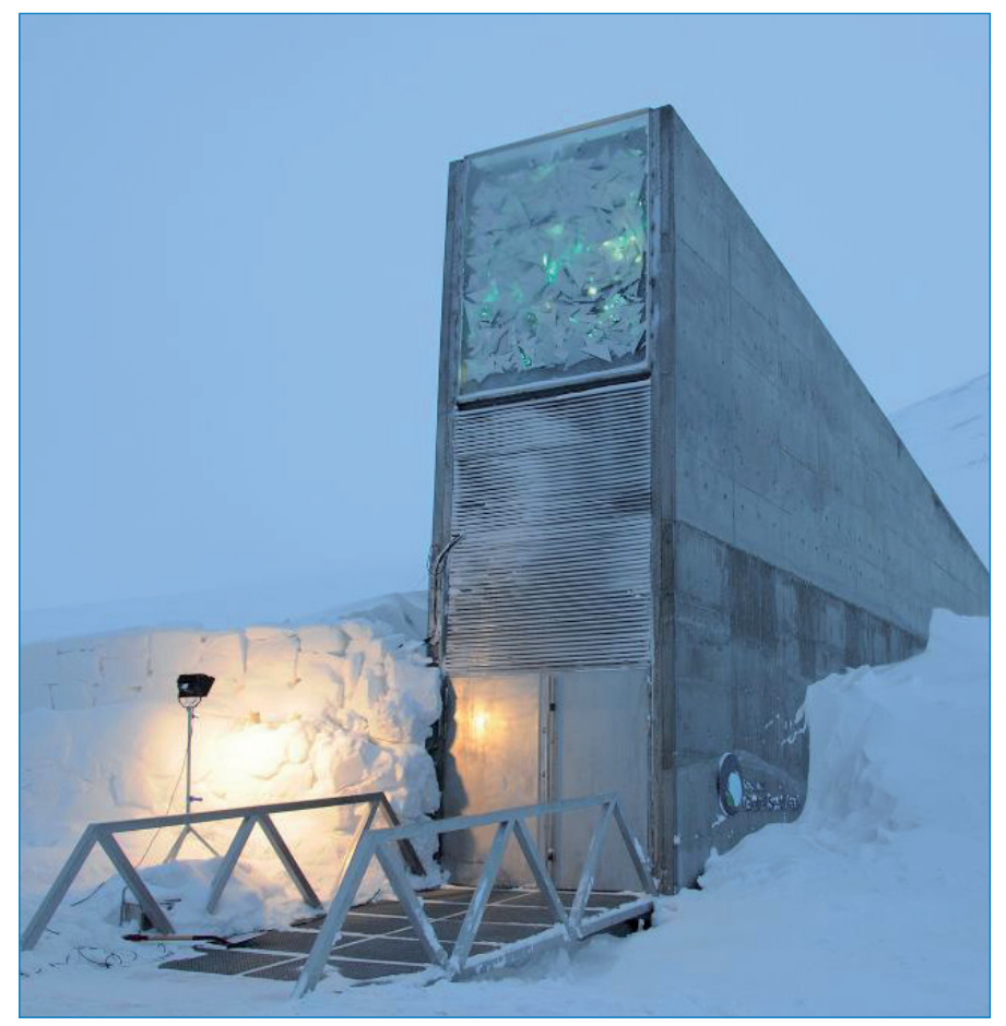
Figure 1: Global Seed Vault - Svalbard (NO)

For more information about the product see the TDS (Technical Data Sheet) on Mapei AS website (www.mapei.com/NO).